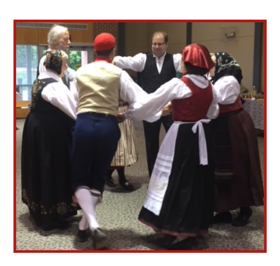
Tusen Takk to all the Lodge members who helped organize this event, assisted with the set up and clean up duties, provided food items for the smorgasbord and attended!